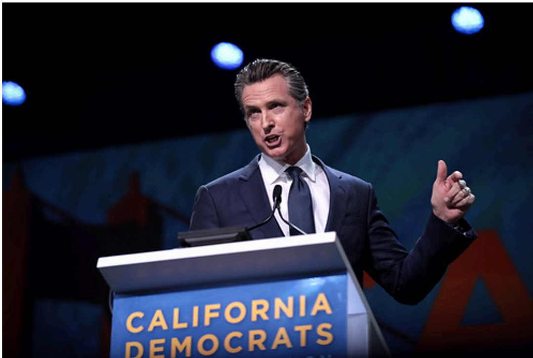
Airbnb is one of Gavin Newsom's top donors. It is any wonder that California is such a short-term rental friendly place? California Democrats march in lockstep with Newsom's policy demands.

We share this as a reminder that many City governments are inherently corrupt and are covered by a local press core unwilling to call out such issues. Your municipality might be a "machine politics" type of town as well. Do you know if any members of your local City Council have owned or are current operators of short-term rentals? This factor could certainly impact the extent and nature of STR regulations in your area given the obvious bias such politicians and administrators harbor towards STRs. It's something to be vigilant of, and we recommend calling it out whenever you see it.